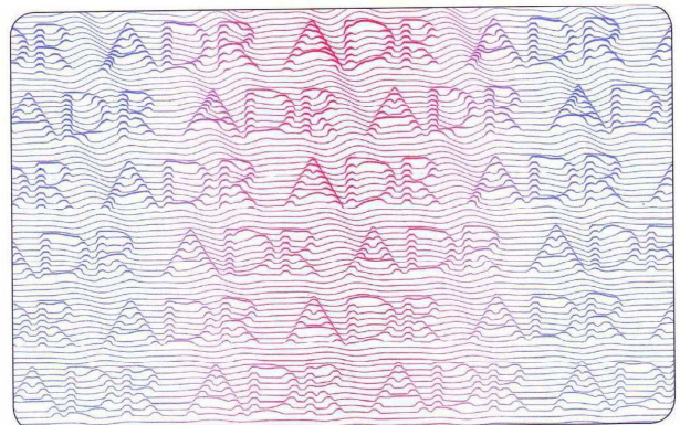
Mod. MC 723F - Verso Fondo Invisibile Fluorescente Iride blu-rosso-blu