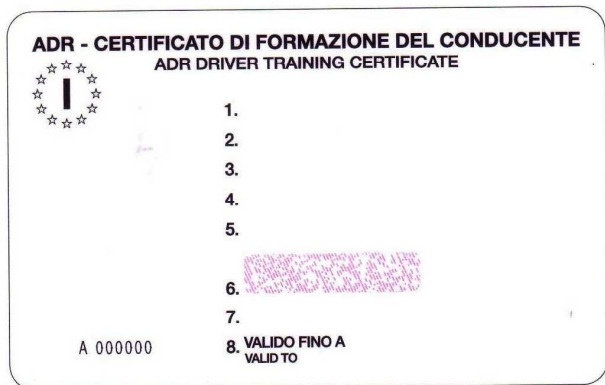
Mod. MC 723F - Recto

The certificate is printed on a plastic card using black ink. It contains an invisible background (blue-red-blue fluorescent-iridescent ink).